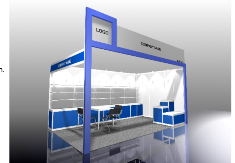
COLOUR PERSPECTIVE N.T.S

Display podium with colour sticker lamination (Respect M-3160)