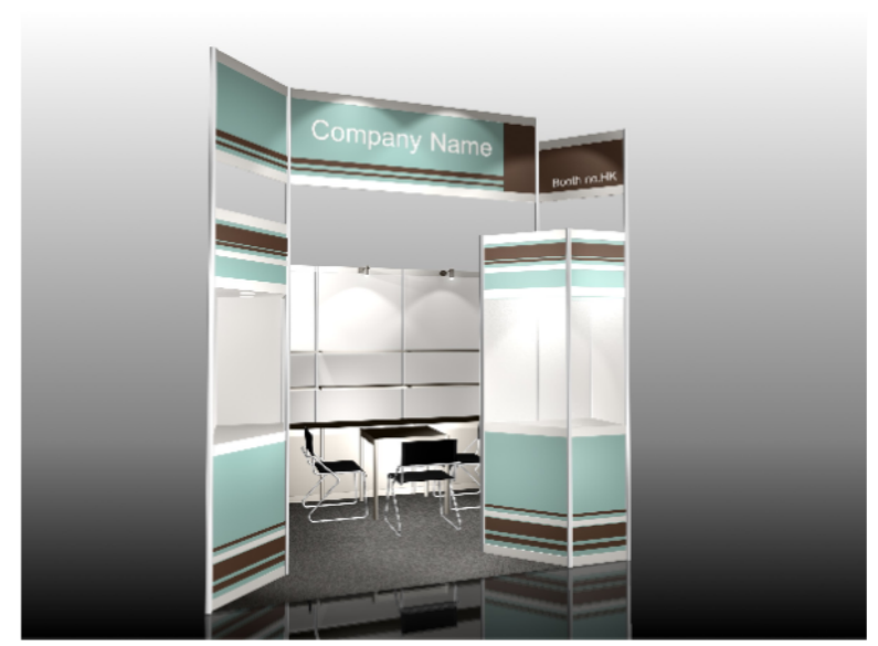
COLOUR PERSPECTIVE N.T.S.